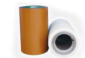
14" SBR IRON CORE