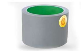
6 " SBR IRON CORE