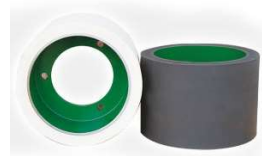
8 " SBR IRON CORE