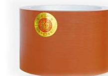
12" NBR ALUMINIUM CORE