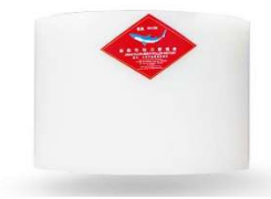
6" ,8" ,10' ,12" ,14 " , 20" ( IRON CORE OR AUMINIUM CORE)