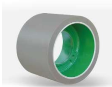
10" SBR IRON CORE