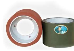
6" NBR ALUMINIUM CORE