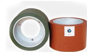
8" NBR ALUMINIUM CORE