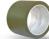
10" NBR ALUMINIUM CORE