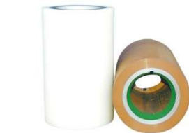
12" SBR IRON CORE